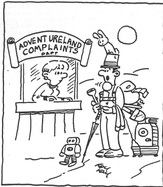
"I'm carrying too much!"